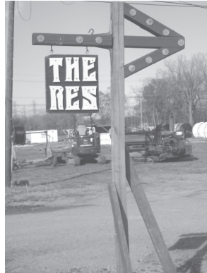
Although a bit battered and bruised, the Res sign still stands tall at the entrance of Scout Lane!

Drive down Capital Avenue by the Res and you will quickly notice that the face of the Res has changed dramatically over the last three months. As part of Indiana Department of Transportation's Capital Avenue/SR 331 Expressway project, contractors have begun clearing the area established for the new highway.